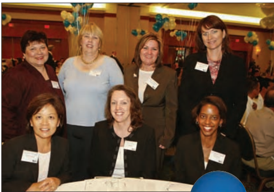
Honoree Kaiser Permanente