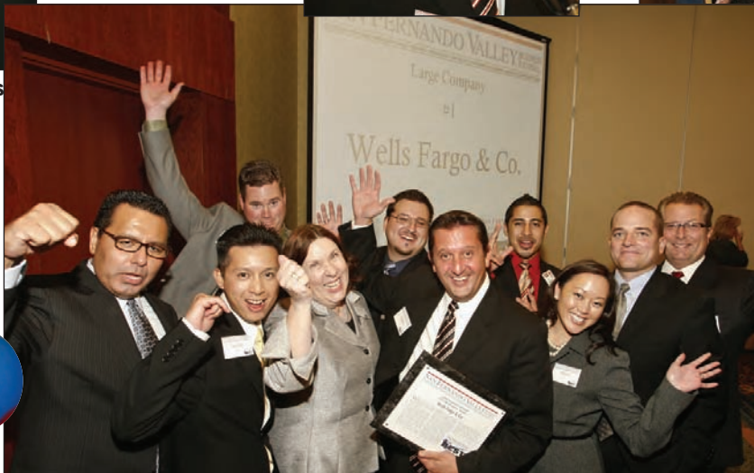
Honoree Wells Fargo Bank