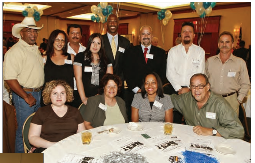
Honoree Tower General Contractors